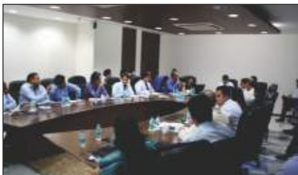
Business planning meet being attended by senior management