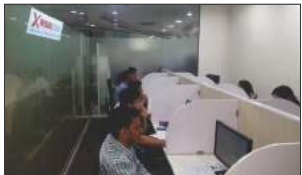
NISM Exam Centre of MSE at Bandra, Mumbai