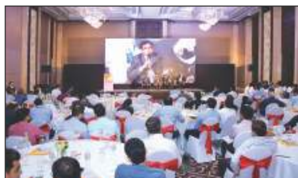
Gathering at MSE re-launch event in St. Regis, Mumbai on July 11, 2017