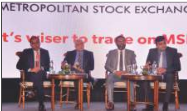
Q & A session at MSE re-launch event in The Oberoi Grand, Kolkata on July 31, 2017